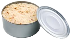
Canned Chicken, Salmon or Tuna