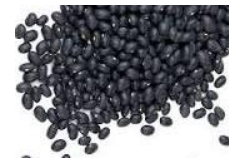
Canned or Dry Beans