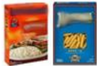
Grains Brown & White Rice, Bulgur, Pasta, Macaroni & Cheese