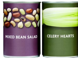
Canned Vegetables low sodium, no salt added